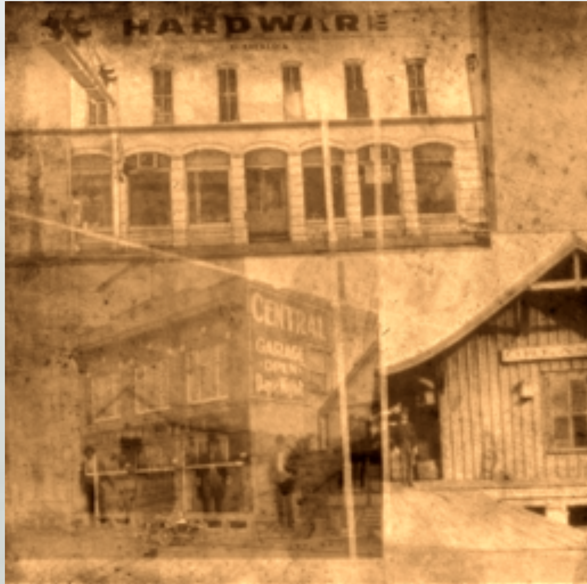
Hardware Central / Sepia