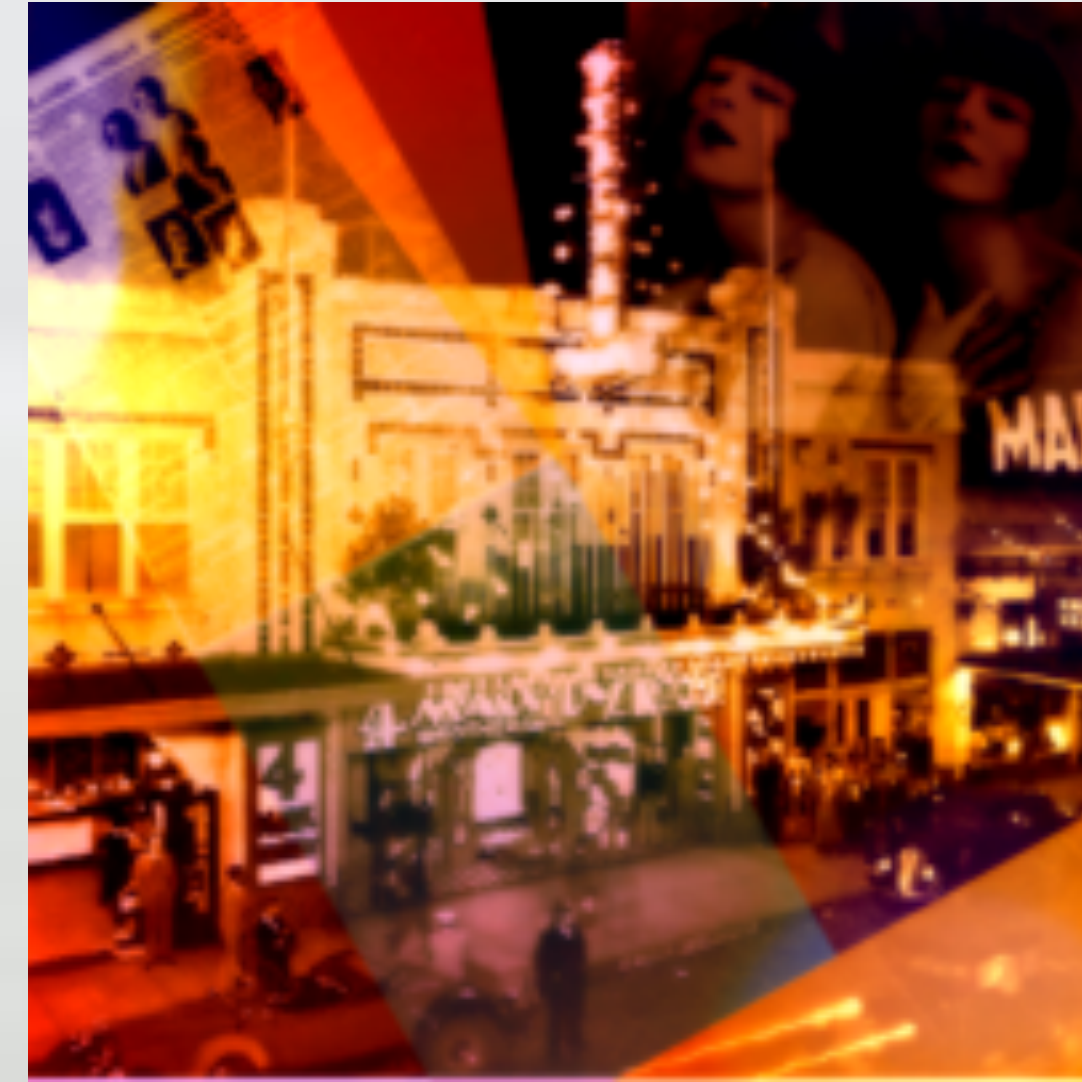
Beacham Theater / Color