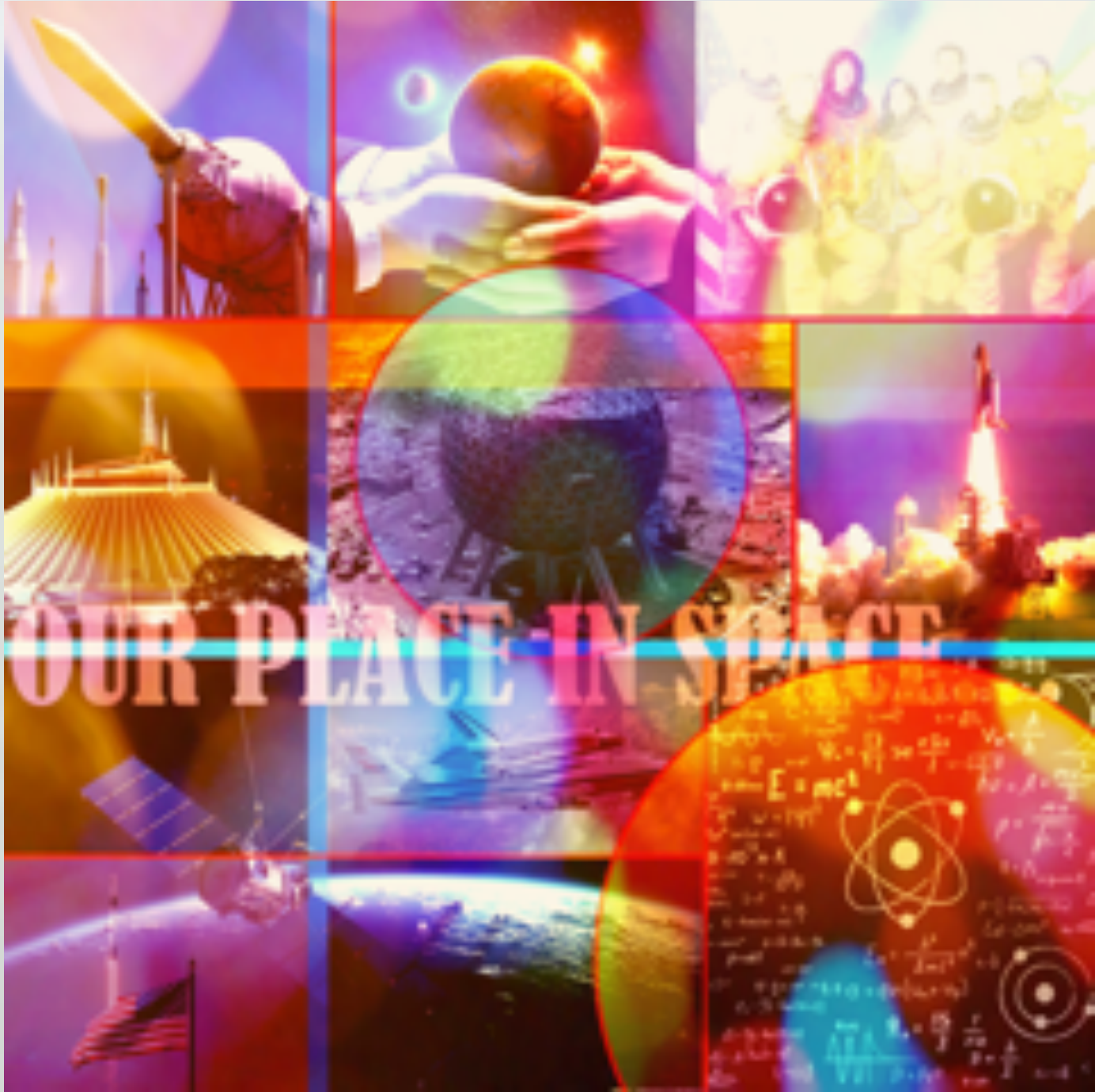
Our Place in Space Impact