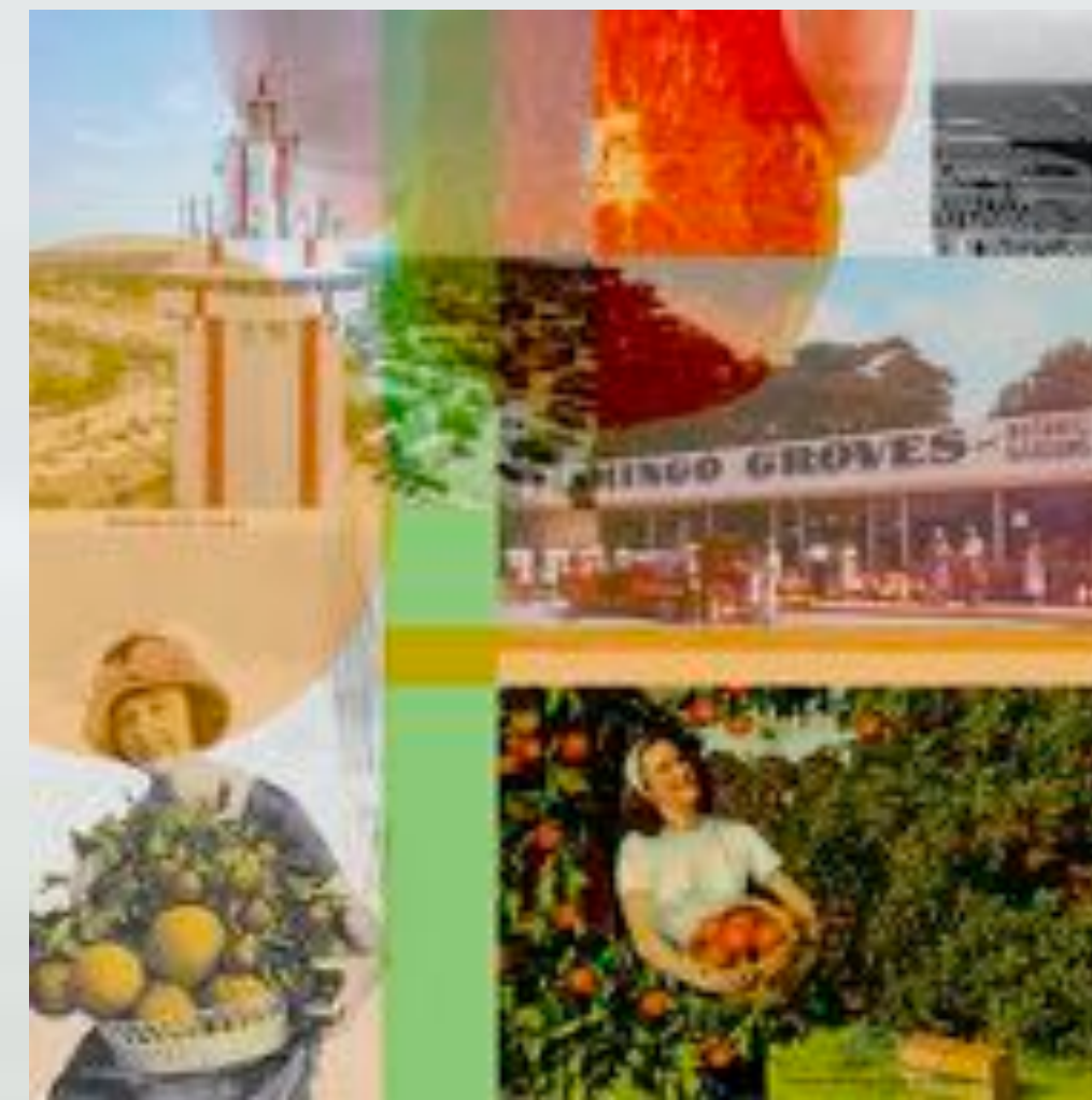
Citrus One / Color