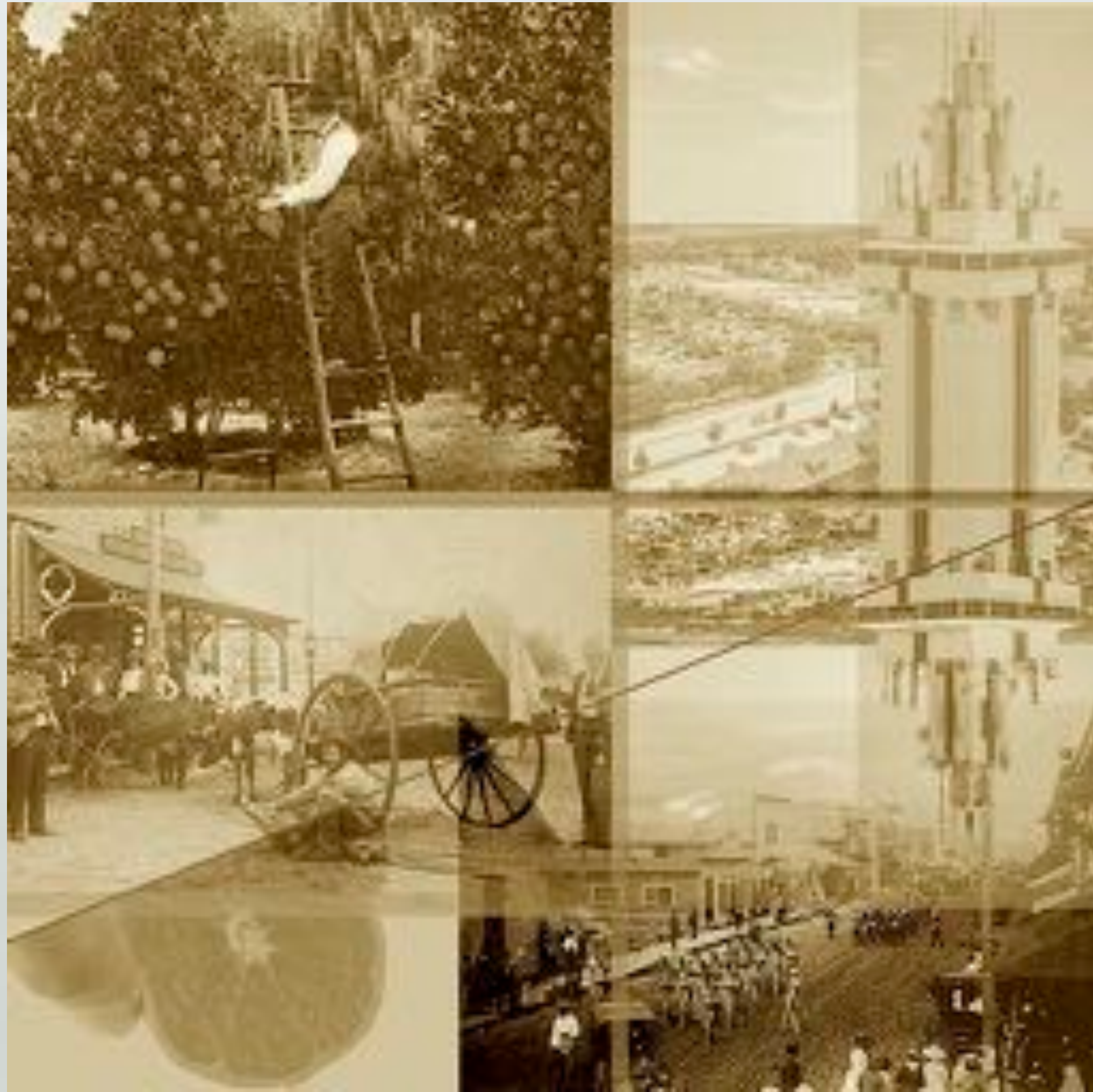
Citrus Two / Sepia