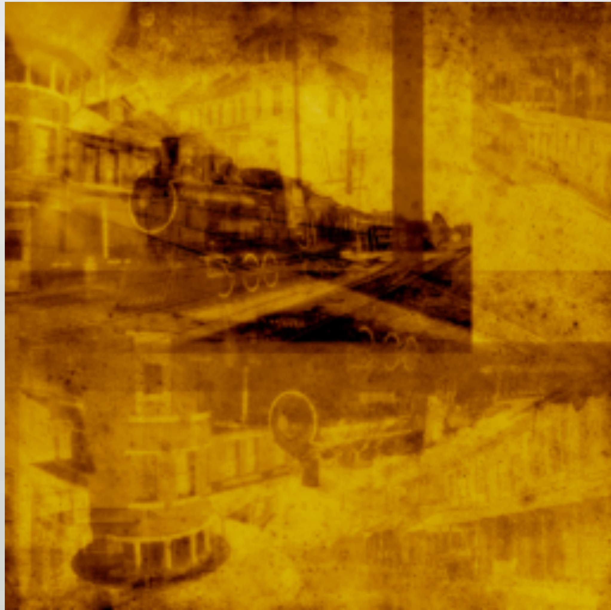
Church Street / Sepia