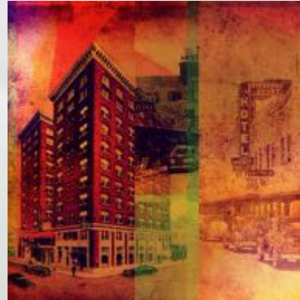
Angebilt & Jefferson Hotels / Color