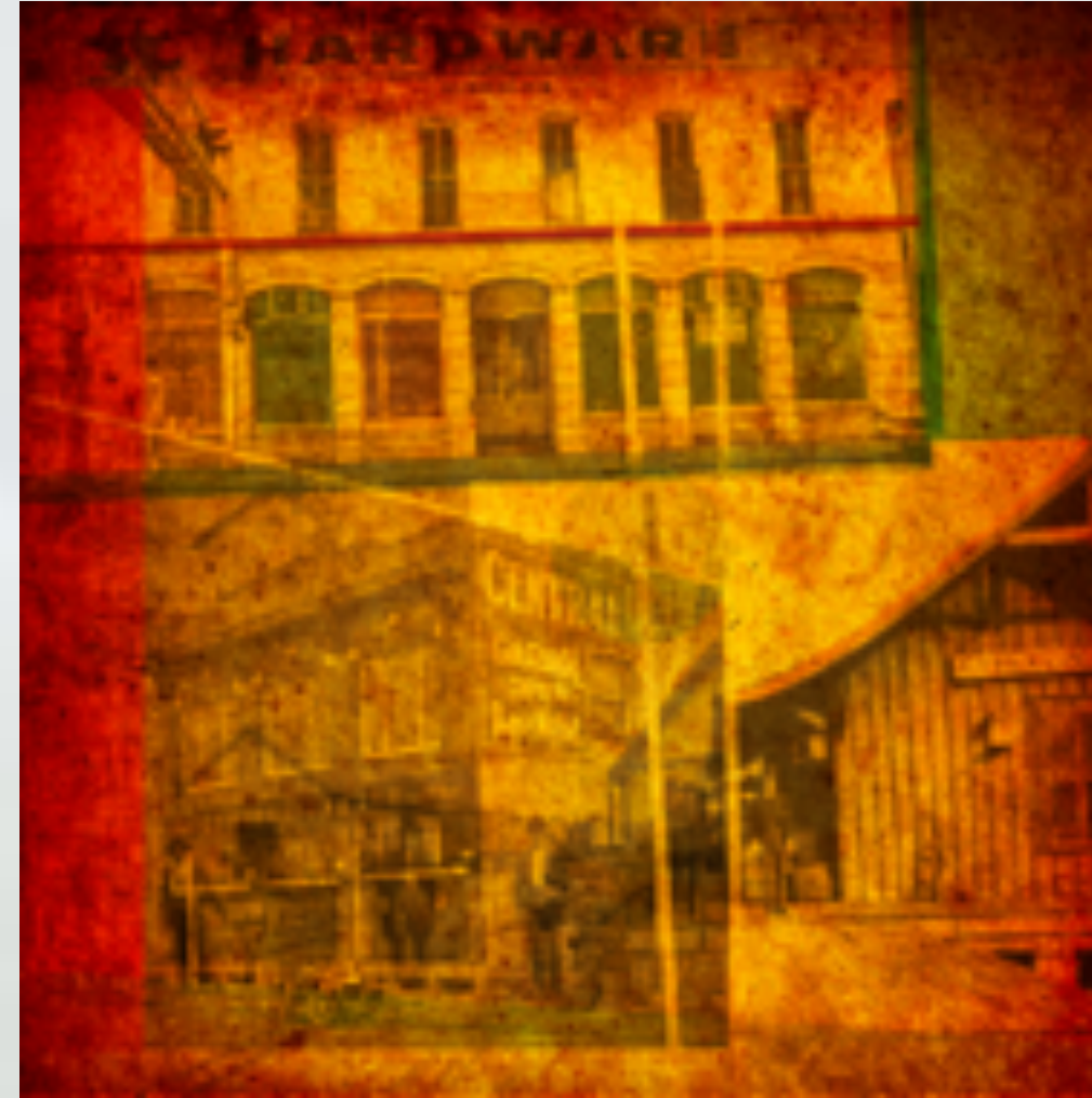
Hardware Central / Color