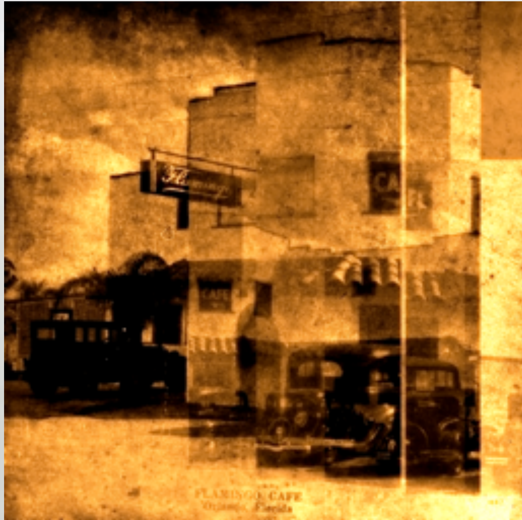
Flamingo Cafe / Sepia