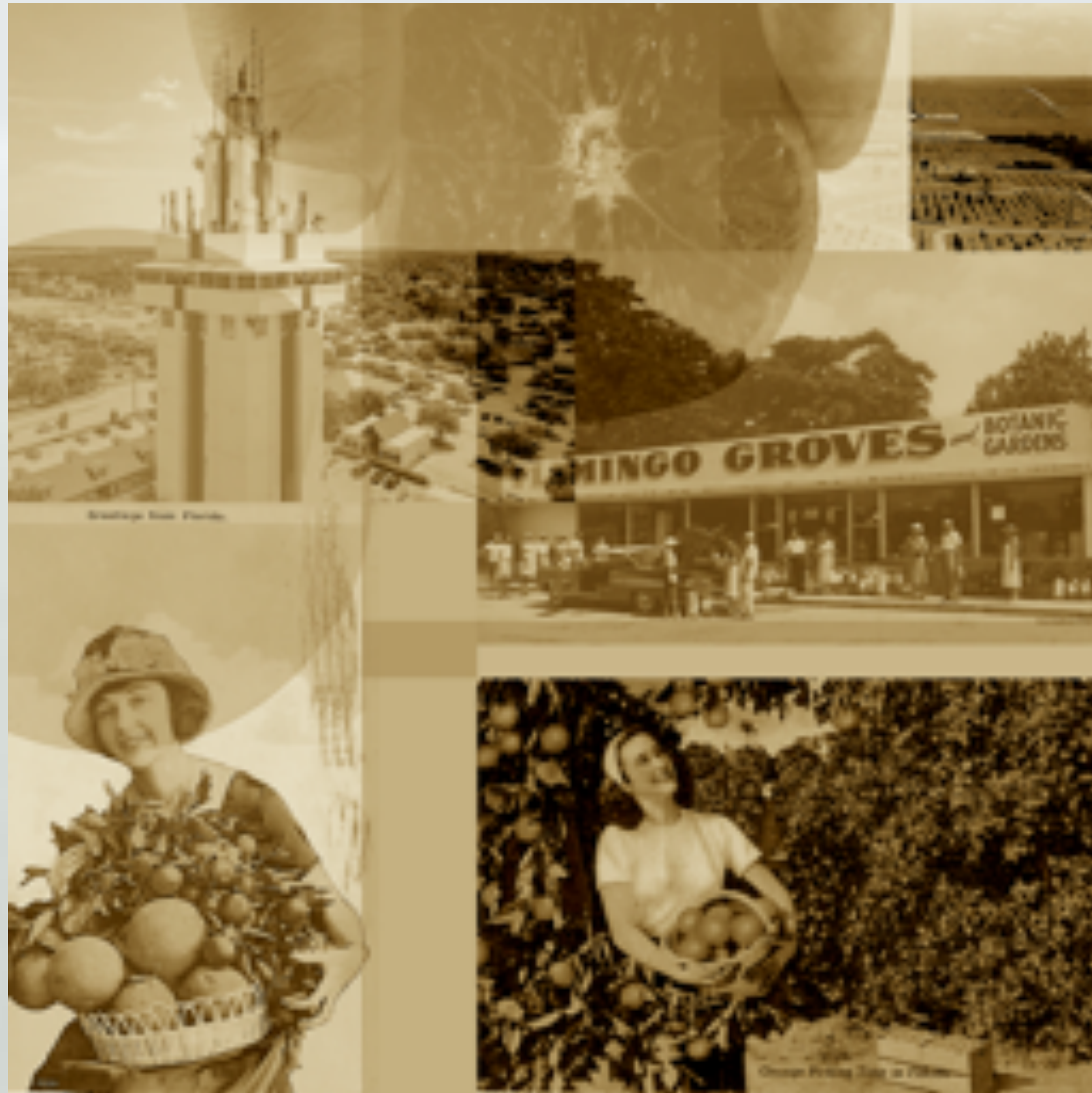
Citrus One / Sepia