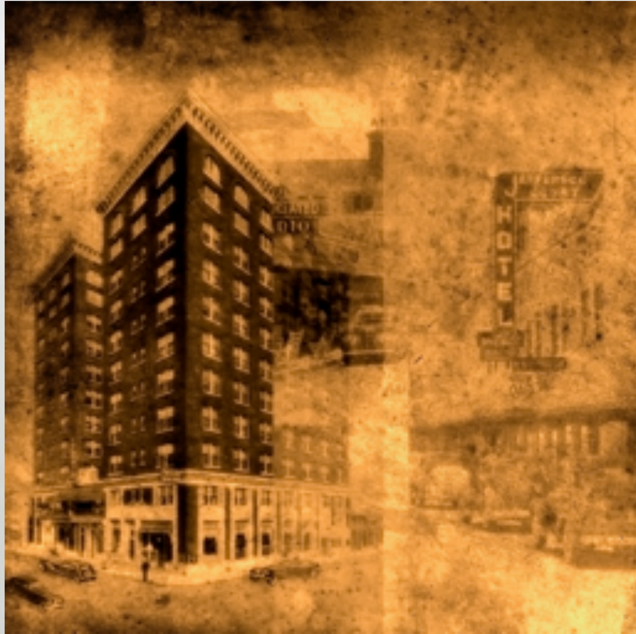
Angebilt & Jefferson Court Hotels / Sepia