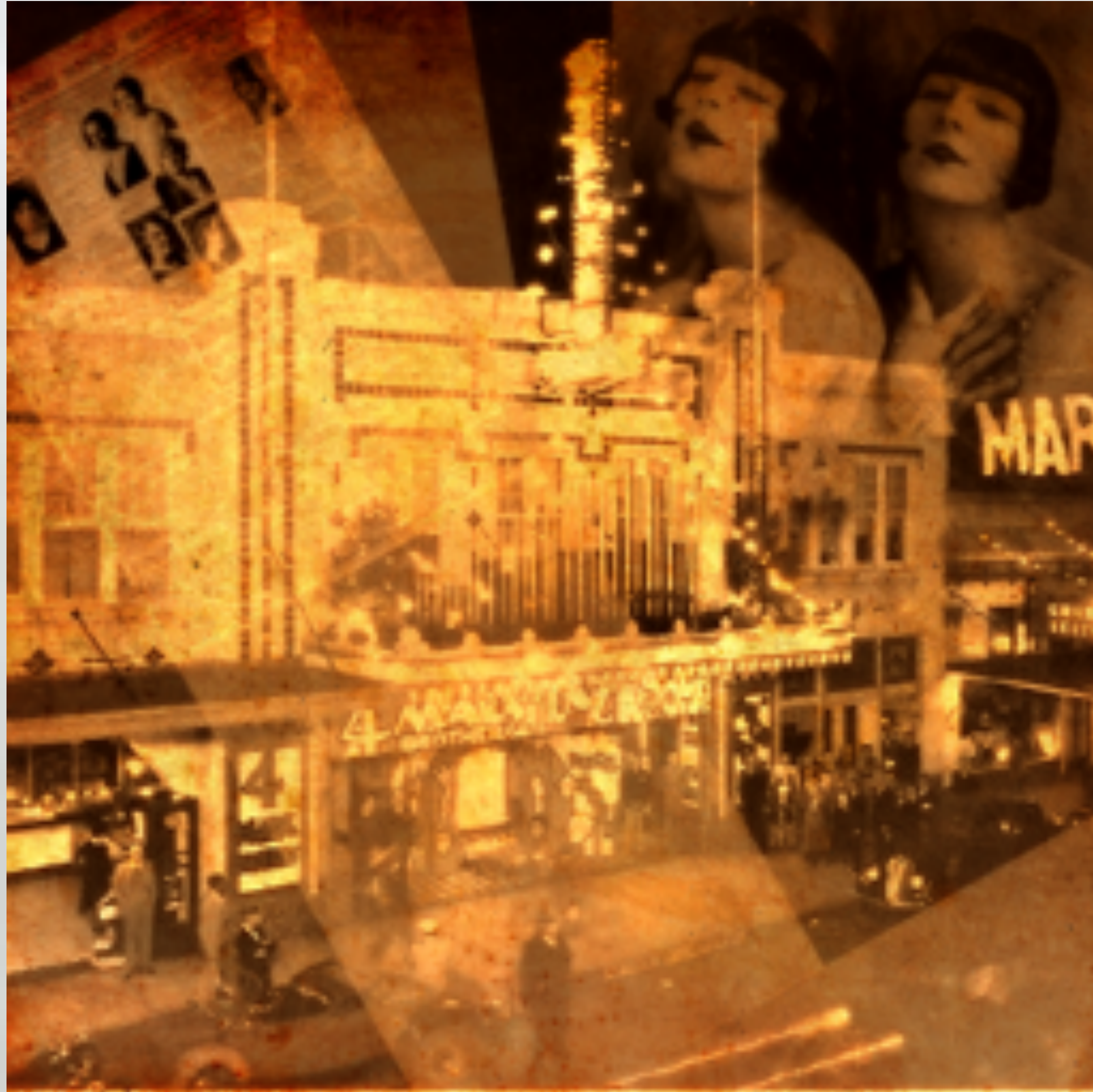
Beacham Theater / Sepia