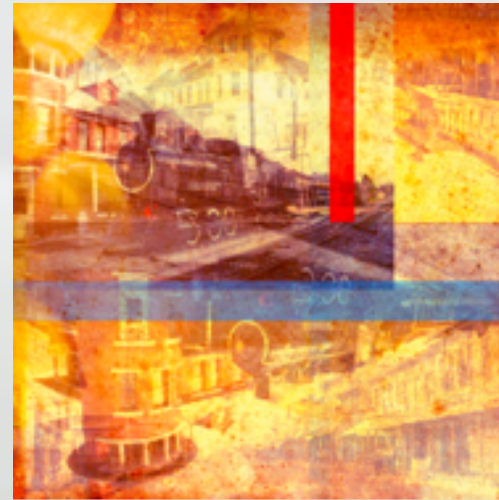
Church Street / Color