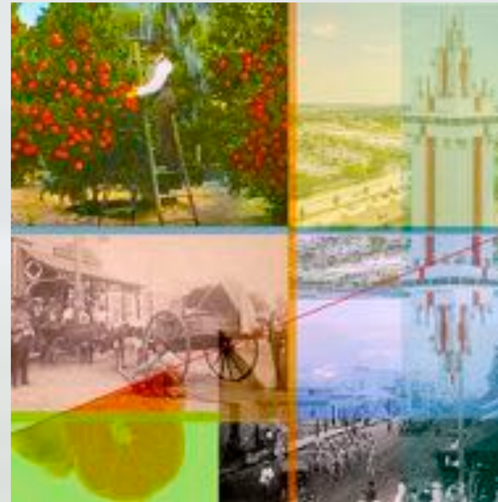
Citrus Two / Color