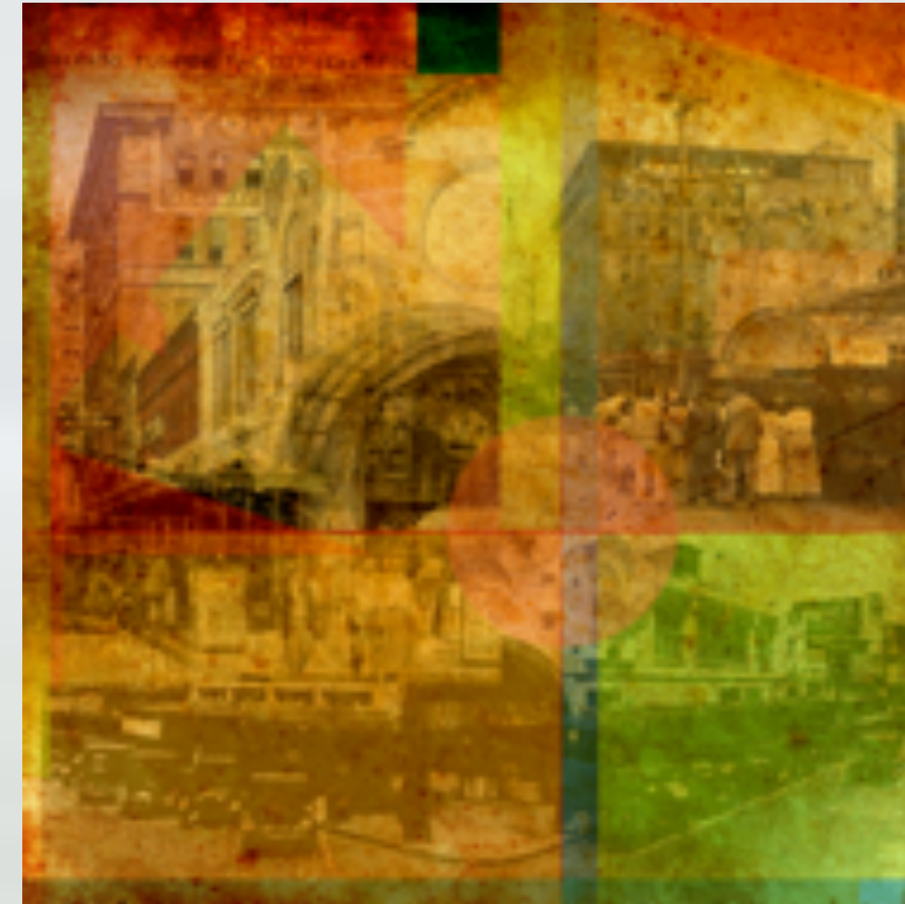
Orange & Pine / Color