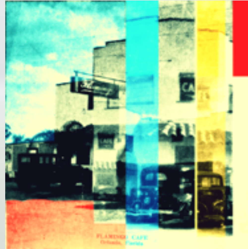
Flamingo Cafe / Color