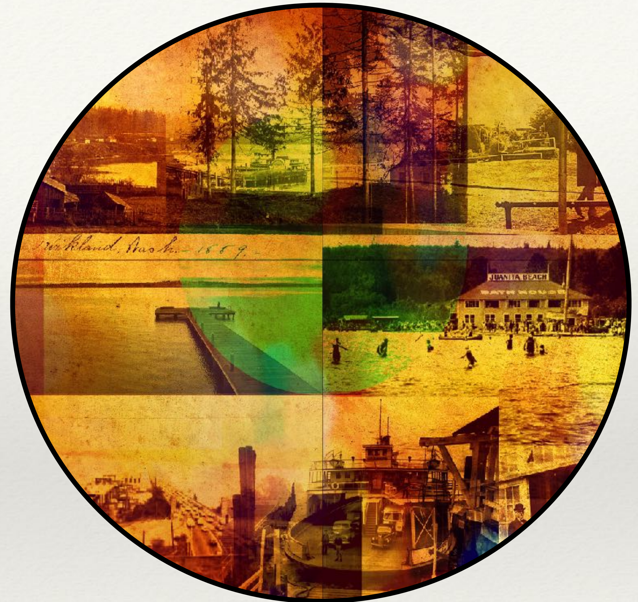
Kirkland Coin 1. of 7